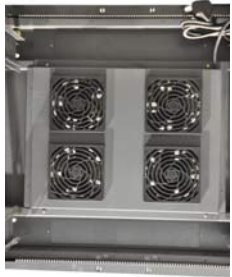
Fan unit underneath top panel