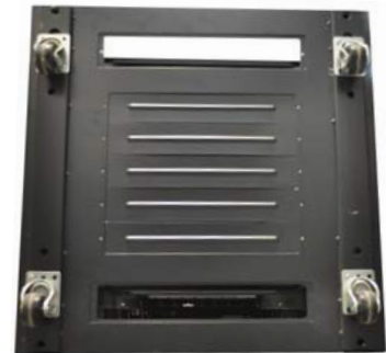
Bottom panel with casters