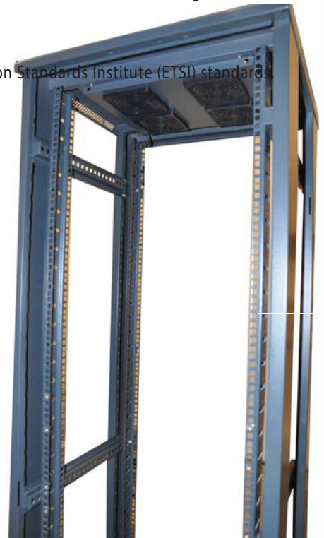
Single welded structure