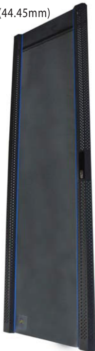
Front glass door